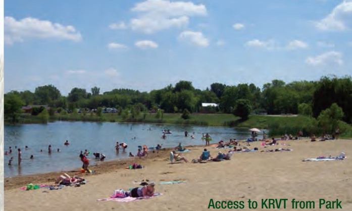
Access to KRVT from Park