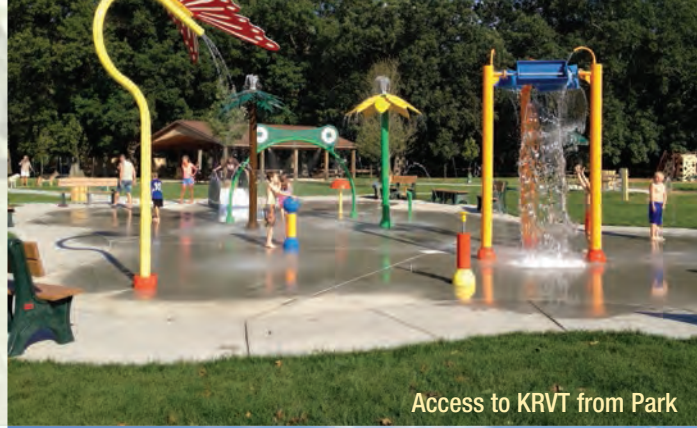
Access to KRVT from Park