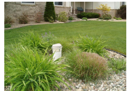
Attractive landscaping protects a 12-inch high wellhead.

Your permit will be mailed (and faxed, if requested) to you upon completion, or you may indicate on the application form that you want to be contacted by phone to pick up your completed permit.