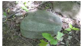
Find a Rock

START HERE: 10 th Street between G and H Ave. (Where the KRVT connects to the Kal-Haven Trail) Head East towards US-131 on the KRVT