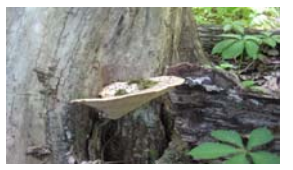
Find a Tree Fungi