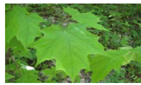
Find a Maple Leaf