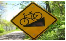
Find a Sign

START HERE: 10 th Street between G and H Ave. (Where the KRVT connects to the Kal-Haven Trail) Head East towards US-131 on the KRVT