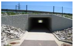
Find the Tunnel

FINISH HERE: Go to www.kalcounty.com/parks/krvt or call 373-5073 to find the mailing address of the Trail Program Coordinator. Mail in your completed Scavenger Hunt to be entered into monthly drawings for great prizes! (1 entry per person, please) Name _____ Phone Number _____ Email Address _____