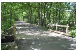
Find a Bridge