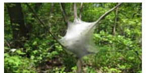
Find a Tent Caterpillar

FINISH HERE: Go to www.kalcounty.com/parks/krvt or call 373-5073 to find the mailing address of the Trail Program Coordinator. Mail in your completed Scavenger Hunt to be entered into monthly drawings for great prizes! (1 entry per person, please) Name _____ Phone Number _____ Email Address _____