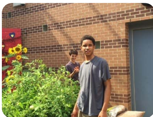
Our residents range in age from 13-17.

On Trac was started in 2007 and is housed within the Kalamazoo County Juvenile Home. We serve court adjudicated youth between the ages of 13 and 17. Our goal is to help our long term residents return to the community with adequate support systems, knowledge of life skills, and the self- confidence to make new and better choices.