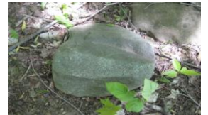
Find a Rock