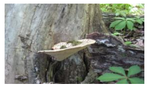
Find a Tree Fungi

START HERE: 10 th Street between G and H Ave. (Where the KRV Trail connects to the Kal-Haven Trail) Head East towards US-131 on the KRV Trail