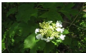
Find a Flower