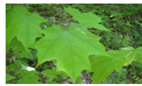
Find a Maple Leaf

Count the yellow dashes on the trail between 10th St. the tunnel: _____