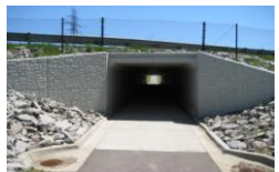
Find the Tunnel