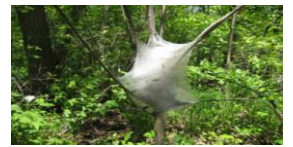
Find a Tent Caterpillar