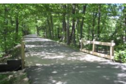
Find a Bridge