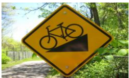
Find a Sign